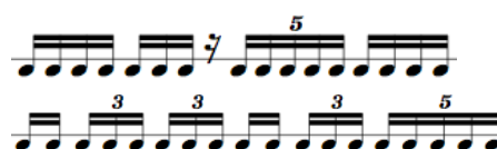
Figure 4. Two musician-determined rhythmic pattern examples.

From this improvisation, all instruments in the ensemble combine to create a semi-chaotic timbral and rhythmic effect that continues for an indefinite period of time. The machine listens for a pattern it recognizes, which initially will be a partial pattern. Once this event occurs, the detected pattern becomes the focus: i.e., the “musical agent” that matches that pattern is initialized and the agent pattern begins to emerge in the score. As illustrated in Figure 5, the musicians begin to interleave the agent pattern (top sequence) with the chaos series (highlighted lower sequence). The score encourages the musicians to gradually play the agent pattern gradually more and more by flickering between the two layers, while the machine increases its reading of partial-pattern detection length.