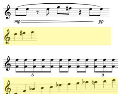
Figure 5. Two examples of an agent pattern that would be animated and interlaced with its corresponding chaos series.

From this improvisation, all instruments in the ensemble combine to create a semi-chaotic timbral and rhythmic effect that continues for an indefinite period of time. The machine listens for a pattern it recognizes, which initially will be a partial pattern. Once this event occurs, the detected pattern becomes the focus: i.e., the “musical agent” that matches that pattern is initialized and the agent pattern begins to emerge in the score. As illustrated in Figure 5, the musicians begin to interleave the agent pattern (top sequence) with the chaos series (highlighted lower sequence). The score encourages the musicians to gradually play the agent pattern gradually more and more by flickering between the two layers, while the machine increases its reading of partial-pattern detection length.